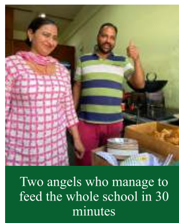
Two angels who manage to feed the whole school in 30 minutes

"NB" : DPSK does not allow the use of cellphones during school. Due permission was taken from the authority to click candid pictures during recess.