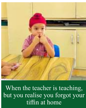
When the teacher is teaching, but you realise you forgot your tiffin at home