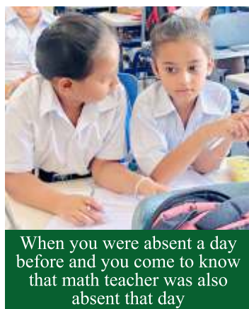
When you were absent a day before and you come to know that math teacher was also absent that day