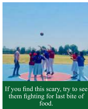
If you find this scary, try to see them fighting for last bite of food.