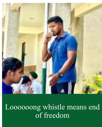
Loooooong whistle means end of freedom