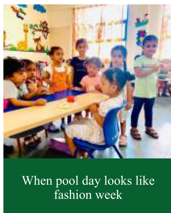
When pool day looks like fashion week